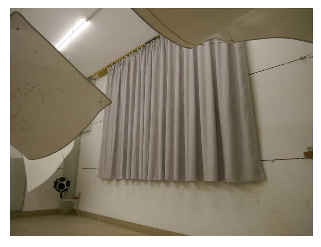
Figure B.2. Test object mounted in the reverberation room, diagonal view.